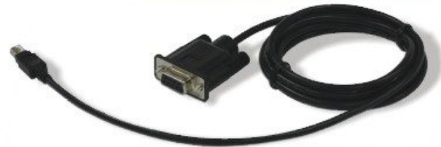
BR13XPC Interface Kit (Optional Purchase)