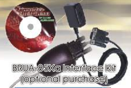
BRUA-85Xa Interface Kit (optional purchase)